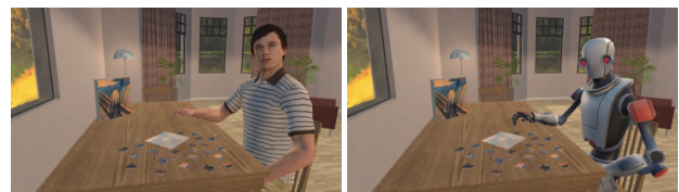
Figure 1: We explored the impact of the appearance and voice of virtual characters on anthropomorphism, animacy, likability, perceived intelligence, and perceived safety. We illustrate the human and robot virtual characters in our experimental virtual reality application.

We approached the aforementioned direction by combining virtual characters with voices in a within-group study design. Specifically, in our 2 (appearance: human vs. robot virtual character) \times 2 (voice: human vs. robot voice) study, we aimed to understand how the four examined combinations impact study participants' perceptions when we instructed them to work collaboratively on the same task with an intelligent virtual character. The two virtual characters we used in our study are shown in Figure 1. The findings from this research could help researchers, practitioners, and developers of virtual reality applications to implement more engaging and effective interpersonal communications between humans and virtual characters. As a result, both the engagement and the immersion of users could increase while simultaneously achieving the necessary perceptual goals.