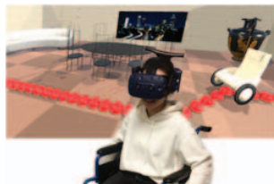
Figure 4: VR wheelchair training.

Virtual Wheelchair Training [7]. We devised a new 3D scene synthesis and path finding approach for generating scenarios for personalized wheelchair training in virtual reality. The generated virtual scenes and paths can be employed for rehabilitation training by a user wearing a VR headset and practicing on a real wheelchair. Users showed improvement in wheelchair control skills in terms of proficiency and precision after receiving the proposed virtual reality training.