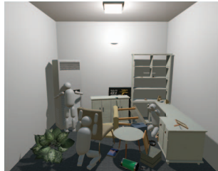
Figure 2: VR earthquake safety training.

Earthquake Safety Training [5]. We leveraged consumer-grade VR devices to provide an immersive and novel VR training approach, designed to teach individuals how to survive earthquakes, in common indoor environments. Our approach made use of virtual environments realistically populated with furniture objects for training. During a training, a virtual earthquake was simulated. The user navigated in the virtual environments to avoid getting hurt, while learning the observation and self-protection skills to survive an earthquake. We demonstrated our approach for common scene types such as offices, living rooms and dining rooms.