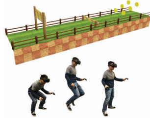
Figure 3: VR exergaming.

Exertion-Aware VR Exergaming [20]. We devised a new VR plugin that can optimize the exercise intensity level (in terms of calories burned and heart rate) of VR exergaming experiences. Our novel approach optimized level designs by considering the physical challenge imposed upon the player in completing a level of motion-based games. A user evaluation validated the effectiveness of our approach in generating levels with the desired amount of exertion.