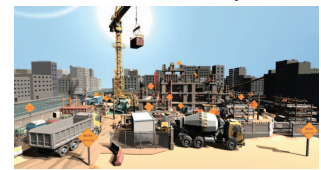
Figure 1: VR construction safety training.

Construction Safety Training [6]. Construction industry has the largest number of preventable fatal injuries, providing effective safety training practices can play a significant role in reducing the number of fatalities. In view of such challenges, we devised a novel approach to synthesize construction safety training scenarios to train users