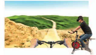
Figure 5: VR biking.

on the user. Given an input terrain, our optimization-based approach generated feasible paths on the terrain which users could bike to perform body training in virtual reality. The approach considered exertion properties such as the total work and the perceived level of path difficulty in generating the paths. To conduct our user studies, we built an exercise bike whose force feedback was controlled by the elevation angle of the generated path over the terrain. Our user study results showed that users found exercising with our generated paths in VR more enjoyable compared to traditional exercising approaches.