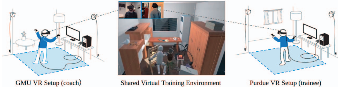
Figure 6: Remote VR earthquake safety training on the envisioned platform.

to brief the participant about the potential dangers in the training scenario, and highlight useful strategies to protect oneself and evacuate during an earthquake.